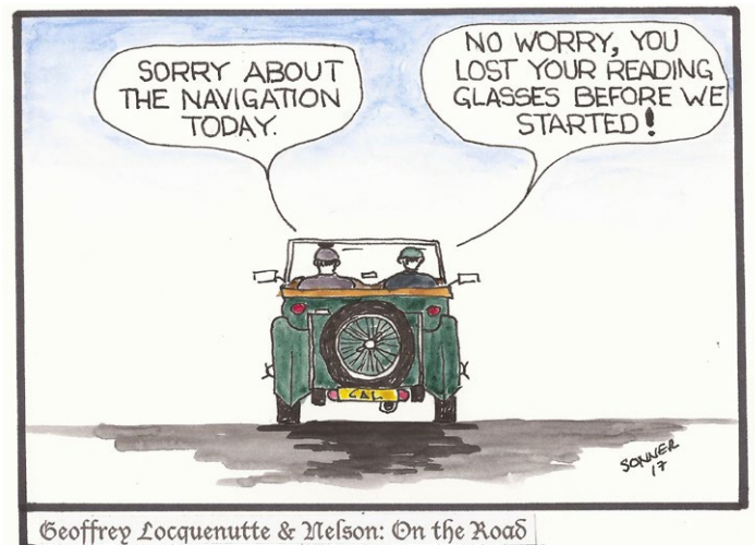
Geoffrey Locquenutte & Nelson: On the Road